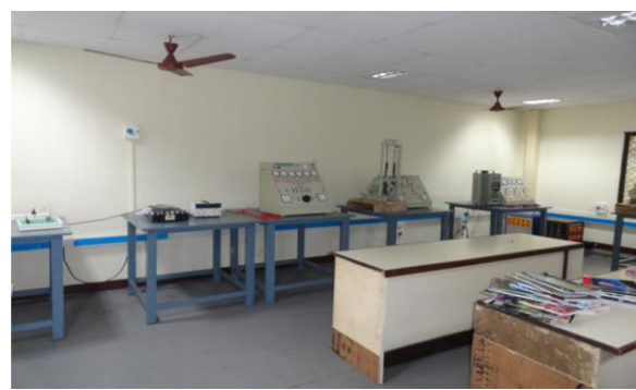
IMU Visakhapatnam offers the following Programmes: